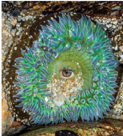
02 - Eye of Anemone.jpg