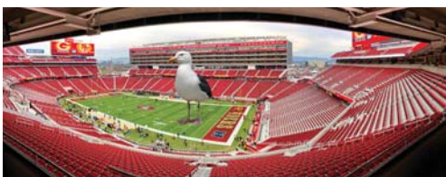
03 - Levi's Birds Eye View.jpg