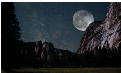
04 - Milky Way with Moon over Yosemite.jpg